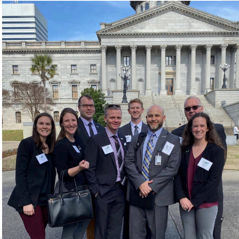
SCATA Hits the Hill February 2020